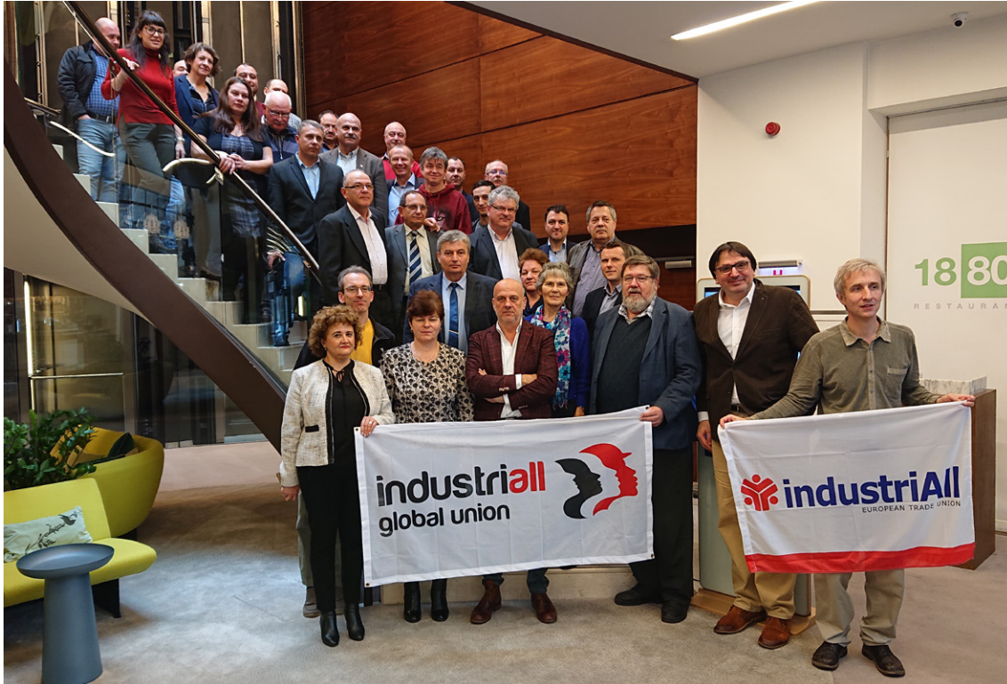
National seminar in Romania, January 2019, TCLF project in South-East Europe.

these suppliers. The projects aimed to finalise the technical development of this tool, validate it with real users and with NGOs running ethical trade certification schemes, and convince SMEs to use it.