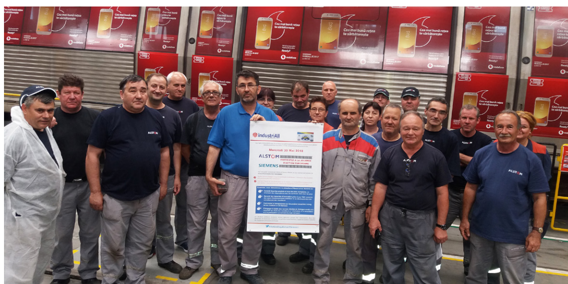
Romanian workers take part in Alstom-Siemens Day of Action in May 2018.

The project 'Link them up! Towards strengthened coordination of national and European levels for effective information-consultation-participation in times of restructuring' intends to address shortcomings by delivering practical and policy recommendations on how to better link information, consultation and participation across different levels and structures in the event of restructuring. Recommendations were drawn from real-life cases in the manufacturing,