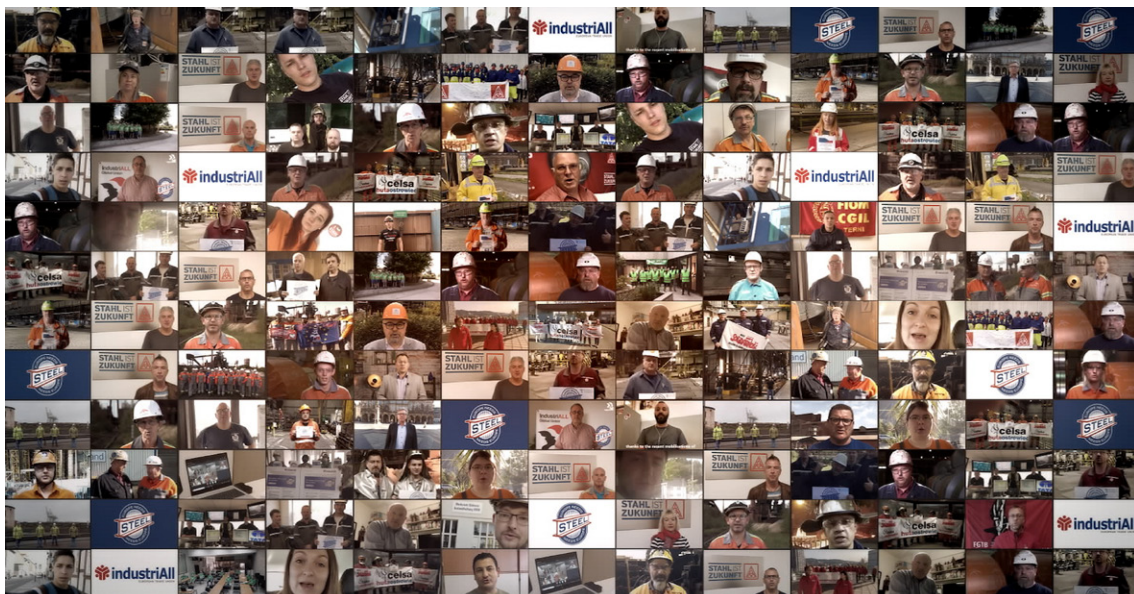
Steelworkers' campaign gained support across Europe in 2020.

2020 has been an extraordinary and unprecedented year for our societies and movement. At industriAll Europe, our primary objective throughout has been to stay closely connected with each other, building solidarity and unity, despite the fact that the pandemic hasn't impacted all countries at the same pace or to the same degree. As vaccines are developed and disseminated through 2021, trade unions will be instrumental in managing the social and economic aftermath of the pandemic. Again, this will not be uniform across countries or unions, and solidarity will be more necessary than ever.