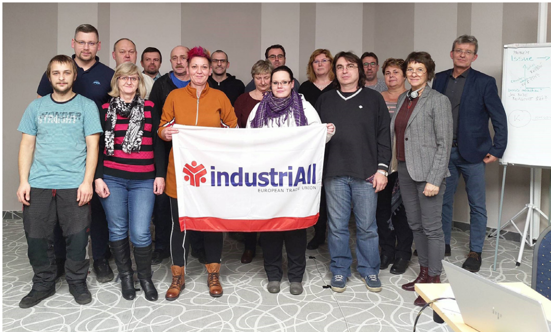
Building Trade Union Power training for OS KOVO activists, October 2019, Prague.

Following the Task Force's decision in May 2019 to take a 'best-practice approach', industriAll Europe has been supporting OS KOVO (CZ) in its intention to develop towards an organising union. At the time of writing, we are working on concrete company organising campaigns in the Czech Republic.