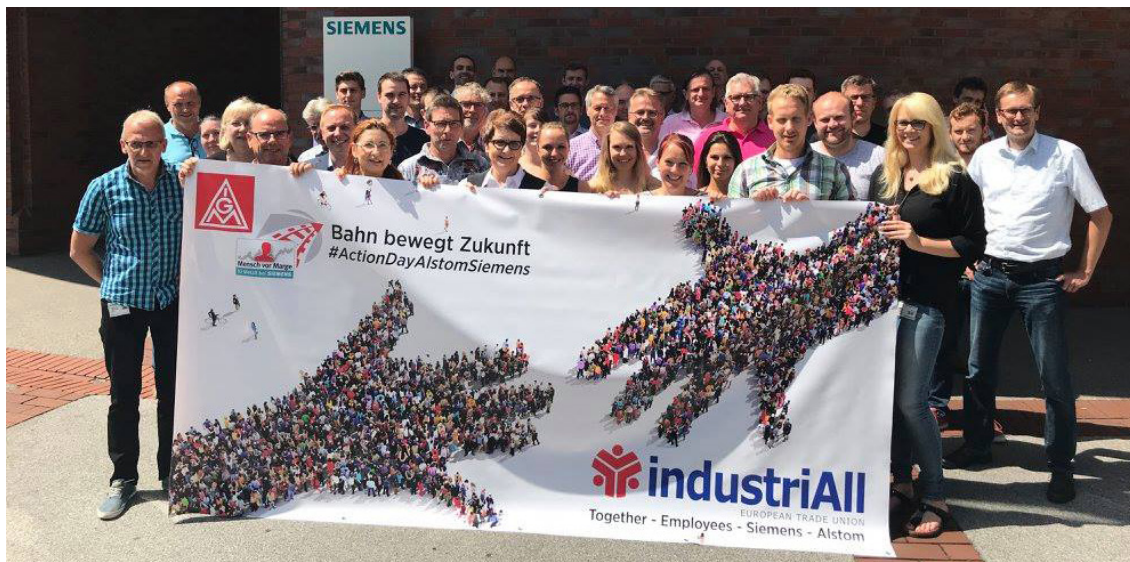
German workers take part in Alstom-Siemens Day of Action in May 2018.

assessment of our trade union coordination and joint actions in those company cases, with a focus on what worked well and what didn't. Drawing upon the conference conclusions, the Company Policy Committee has launched a reflection on how to improve industriAll Europe's support for trade union action in instances of transnational restructuring.