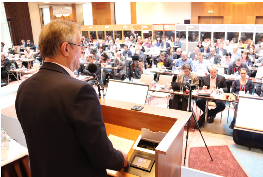
Collective Bargaining and Social Policy Conference, Bratislava, 6-7 December 2018.

As a direct follow-up to the project and the Conference, industriAll Europe launched the 'Together at Work' campaign for collective bargaining on 26 September 2019. The campaign aims to promote the benefits of collective bargaining around Europe, for workers but also for the economy and society as a whole.