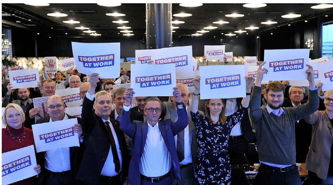
Finnish Prime Minister supporting Together At Work campaign at the Executive Committee in November 2019.