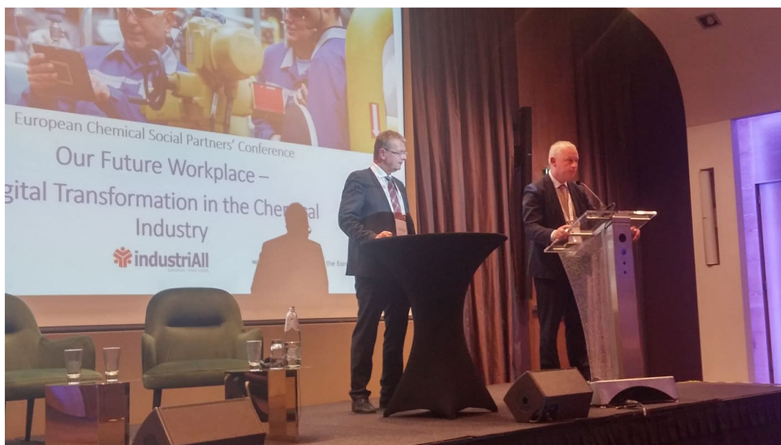
Chemical social partners sign recommendations on digital transformation, November 2019.

The 2018-2019 project, 'The impact of digital transformation and innovation in the workplace: a sector specific study of the European chemical, pharmaceutical, rubber and plastics industry