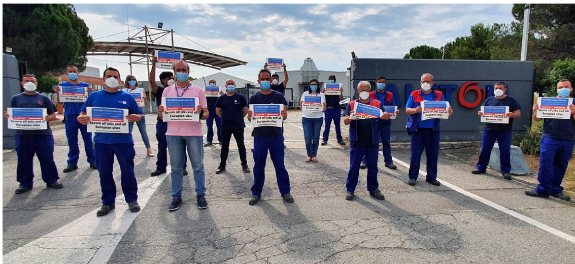
Alstom Bombardier Action Day 16 July 2020, Santa Perpètua Plant

Throughout 2020, industriAll Europe increased its support to trade union representatives in multinational companies. In addition to monitoring and advising EWC and SE (re-)negotiations, industriAll Europe continued to develop practical tools and resources, including a shared list