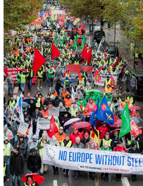
'No Europe without Steel' demonstration in November 2016, organised by industriAll Europe.

Global overcapacity and unfair competition remain the main threats to the European steel and aluminium sectors. IndustriAll Europe has therefore campaigned for modernised Trade Defence Instruments and a New Method of Anti-Dumping, both adopted by the EU in 2018. IndustriAll Europe continues to call for transparency and for an end to unfair state aid by lobbying the EU and playing an active role in the OECD Steel Committee. In 2019, industriAll Europe was the first trade union organisation to address the Global Forum of Steel Excess Capacity (made up of Ministers from the G20 countries).