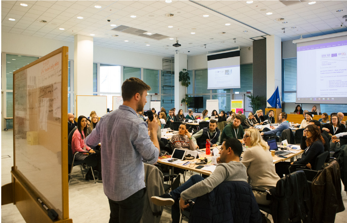
IndustriAll Europe's Youth Working Group contributed to the ILO/ETUC European Youth Empowerment Conference in December 2019.

employment for young people in Europe: digitalisation & innovation, flexibility, internships/ apprenticeships and mobility.