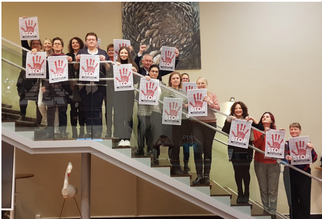
Equal Opportunities Network says 'Stop Violence Against Women', November 2019.

The position paper 'For a fair digitalisation – close the gender gap!' describes the gender-specific challenges and opportunities of the digital transformation. It was adopted by the Executive Committee in November 2018.