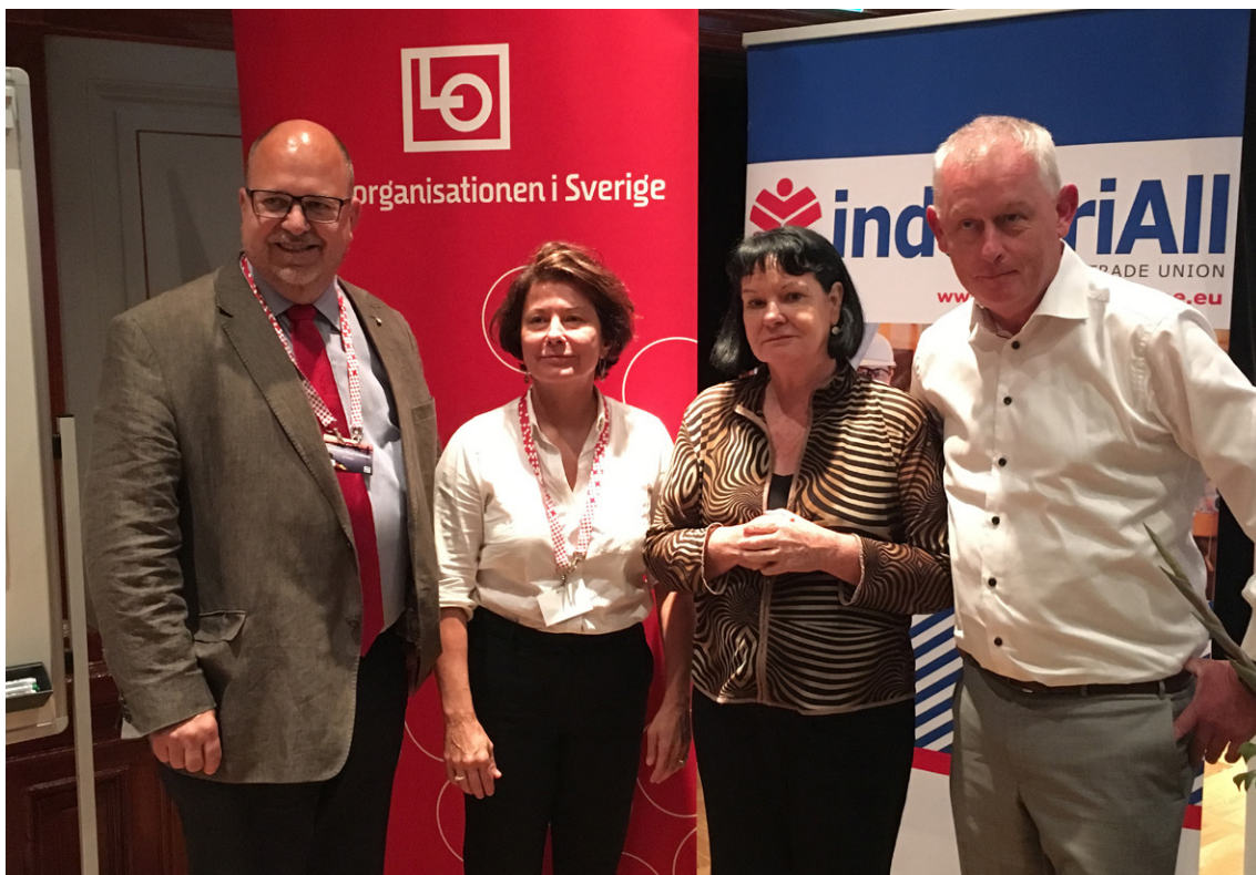
Just Transition and Heavy Industries Roundtable, Stockholm, August 2019.

The Industrial Policy Committee is deeply engaged in the subject of the circular economy. The transition from the current 'linear' economy, where matter flows from the mine to the