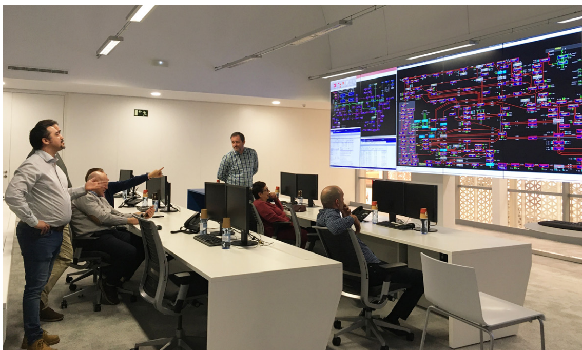
'Skills2Power' project, social partner workshop, Madrid, February 2020.

One major aspect of the Just Transition is the anticipation of skills needs and the requirements for Vocational Education and Training (VET) systems. The social partners have addressed these issues through a joint project. The outcome was a report with a set of recommendations to social partners and a Social Partner Roadmap on Skills and Qualifications for the upcoming years that was adopted in October 2018. On this occasion, the electricity social partners also