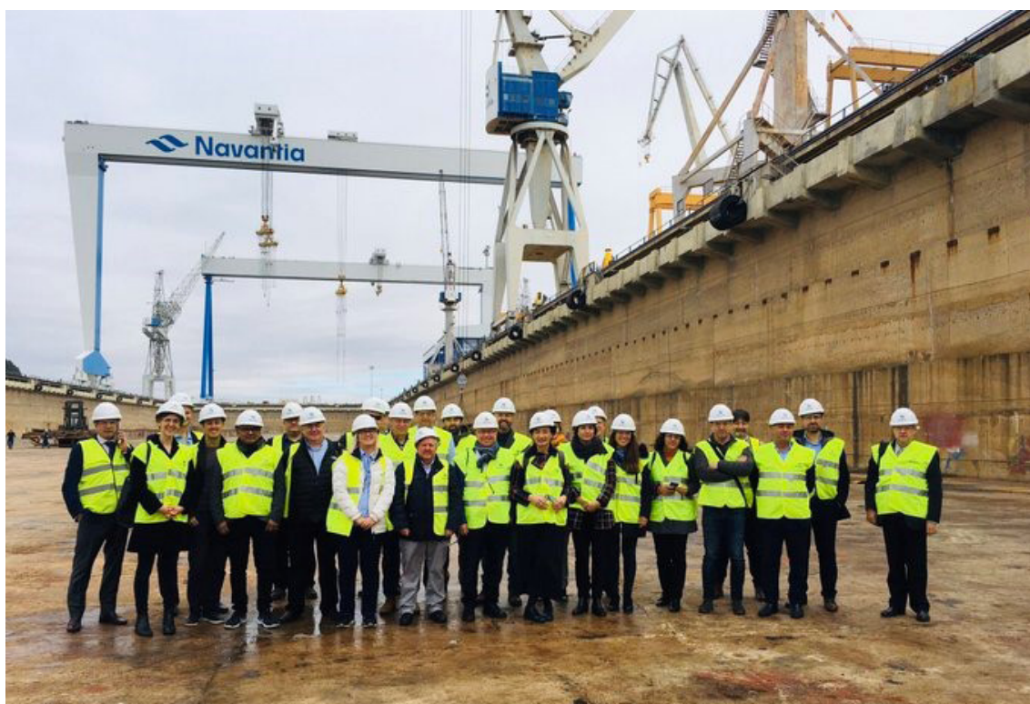
Workshop of the 'Upskilling Shipbuilding Workforce in Europe' project, Cadiz, December 2019.

The SSDC meetings were given a thematic focus, addressing themes such as globalisation, industrial policy and social policy. European and international experts, including from the OECD and ILO, have been invited to the meetings.